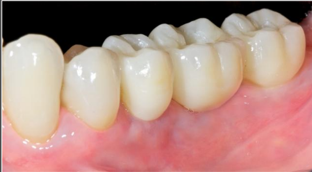
Definitive restoration on NobelReplace PS implants.