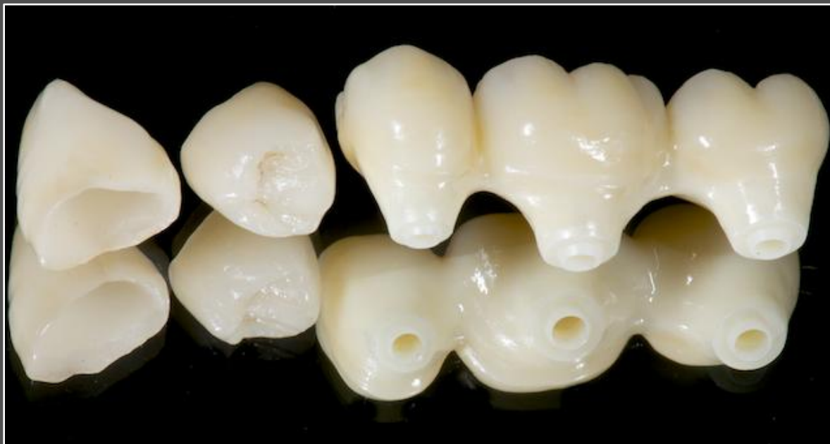
Procera implant bridge on implant level with 2 Procera crowns on teeth.