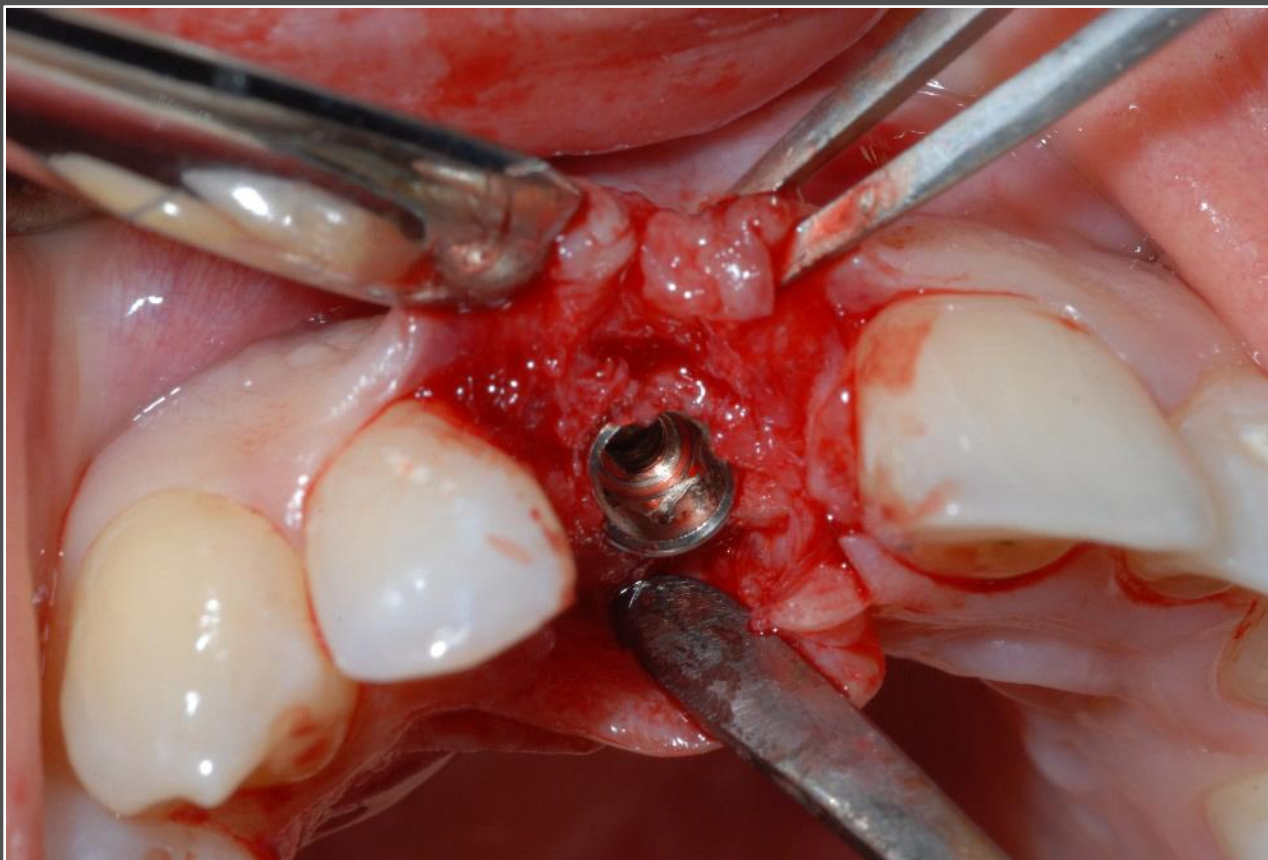
Placement of NobelReplace CC implant.