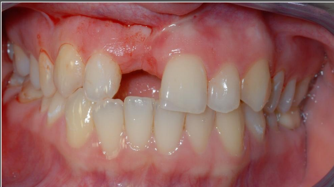
Initial clinical situation