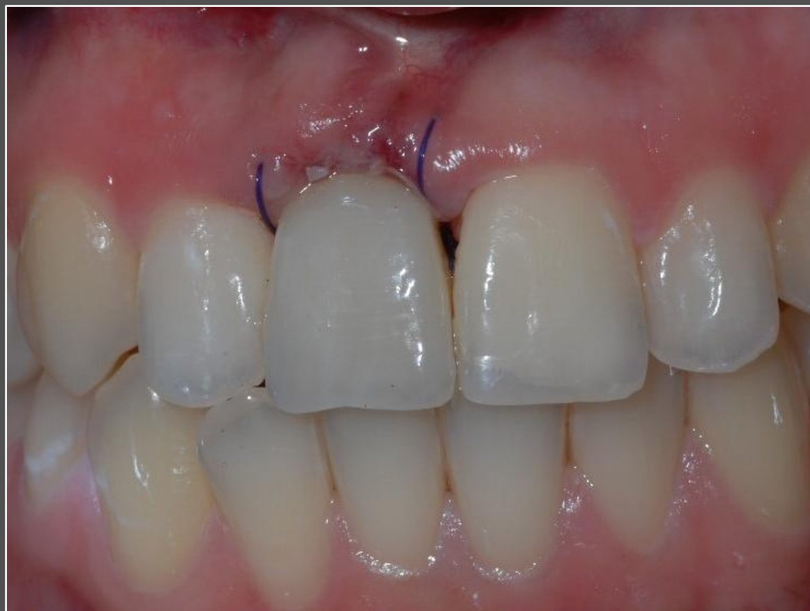
Temporary restoration on implant #11.