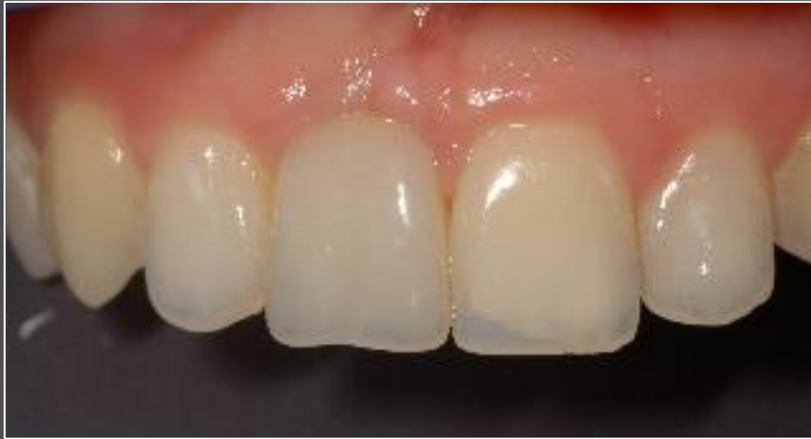
Temporary restoration on implants after 4 months healing